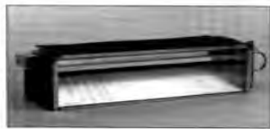
MOTORIZED FRESH AIR DAMPER

A blank off plate is installed on the inside of the service door. It covers the air inlet openings which restricts any outside air from entering the unit. The blank off plate should be utilized in applications where outside air is not required to be mixed with the conditioned air.