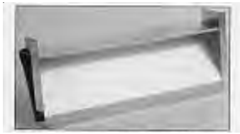
BAROMETRIC FRESH AIR DAMPER

Bard Wall-Mounts are designed to provide optional ventilation packages to meet all of your ventilation and indoor air quality requirements. Standard on all units is the barometric fresh air damper. All packages can be ordered built-in at the factory or can be easily field-installed at the time of installation of the Wall-Mount, or can be retrofitted at a later date.