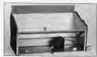
COMMERCIAL ROOM VENTILATOR

NOTE: The above vent systems are intake only without built-in exhaust capability. Building will likely require separate field installed barometric relief or mechanical exhaust elsewhere within the conditioned space. Balancing dampers in the return air grille may be required to achieve specified amount of outdoor air intake.