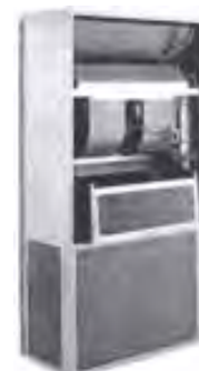
Unit shown with optional Economizer.