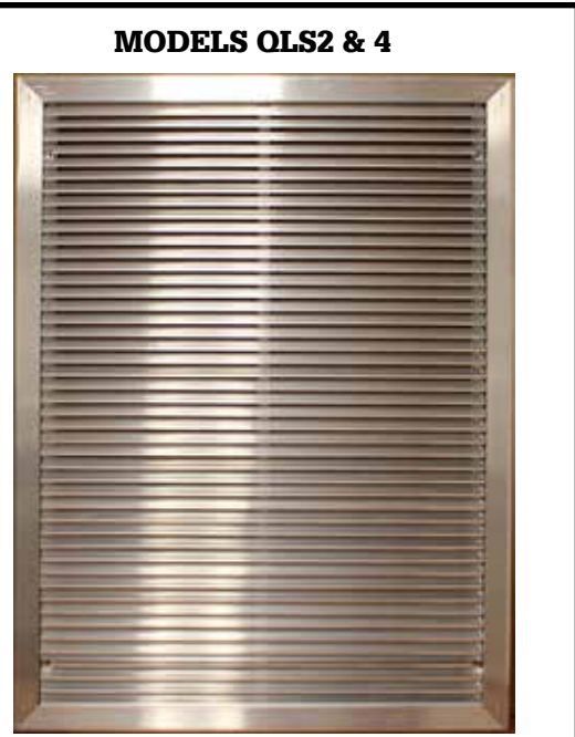
An attractive mechanical air louver with a removable service core that utilizes our exclusive shading "C" blade.