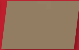
5 = DESERT BROWN