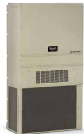
Wall-Mount™ Heat Pump