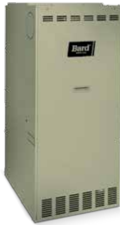
FH Series Oil Furnace