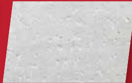
A = ALUMINUM