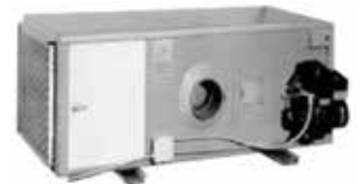
SOF Series Oil Furnace